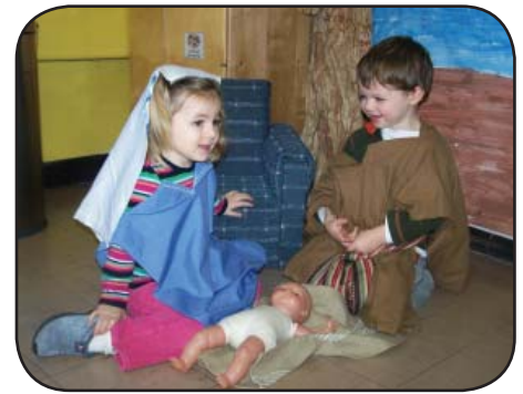
Mary, Joseph and Baby Jesus