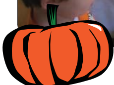
Preston's dad helps cut the class pumpkin.