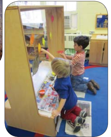
Rajiv and Jack paint fall colors in their classroom