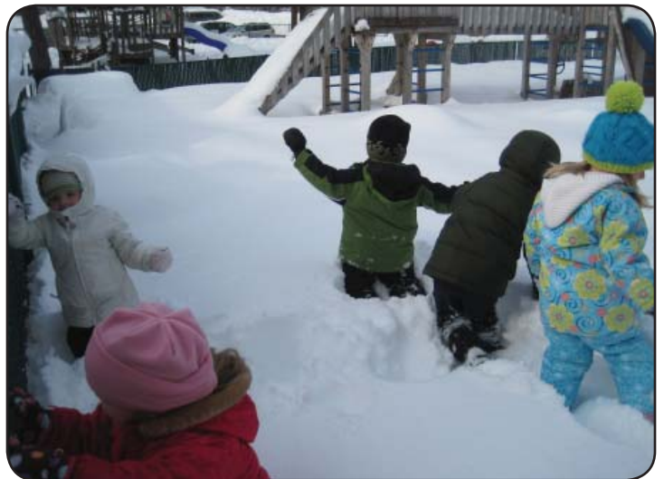
Thigh high fun!