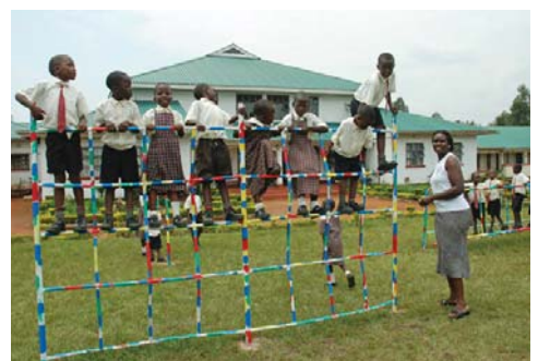
Nambale Magnet School teacher with primary students climbing the bars that they had very creatively painted by themselves.