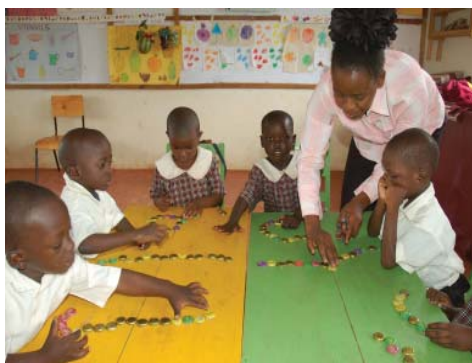
Nambale Magnet School teacher with kindergarten students learning to count, add & subtract with bottles caps.

"Bukula, sindenya mapesa," the lady speaks in the local dialect which means; Take them for free.