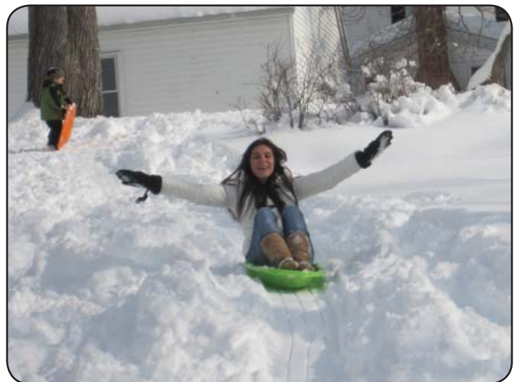
Even the “big kids” had fun!