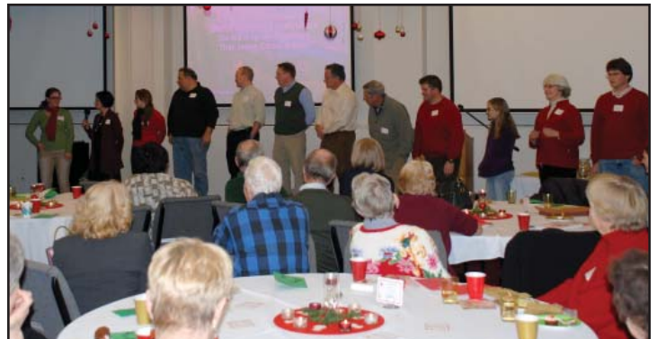
Twelve Days of Christmas Sing-A-Long!