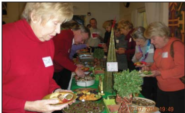
Crowds gather at the food tables.