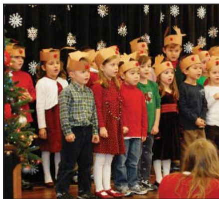
Pre-K Class singing at the Darien Senior Center